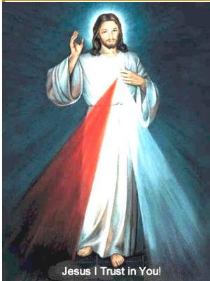
Jesus | Trust in You!

هذا هو الأحد الجديد فيه يخلقنا المسيح من جديد ويعطي سلطاناً للكنيسة لتمجي خطايانا وترحمتنا. هذا هو الأحد الجديد، عيد الرحمة الإلهية التي لا تتوقف عن الخلق الجديد. آمين